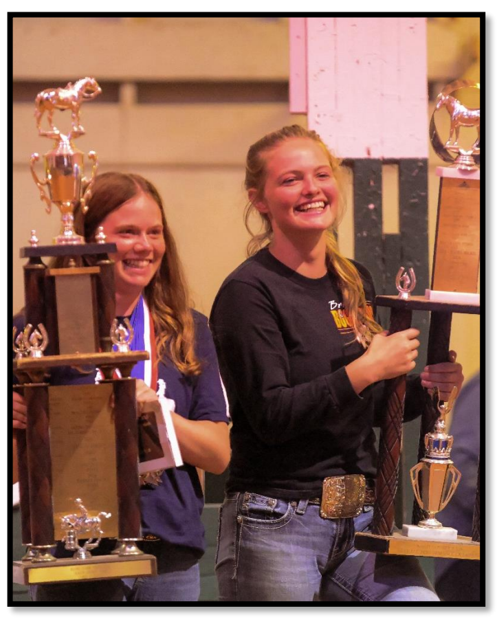
Exhibitors and their goals accomplished!