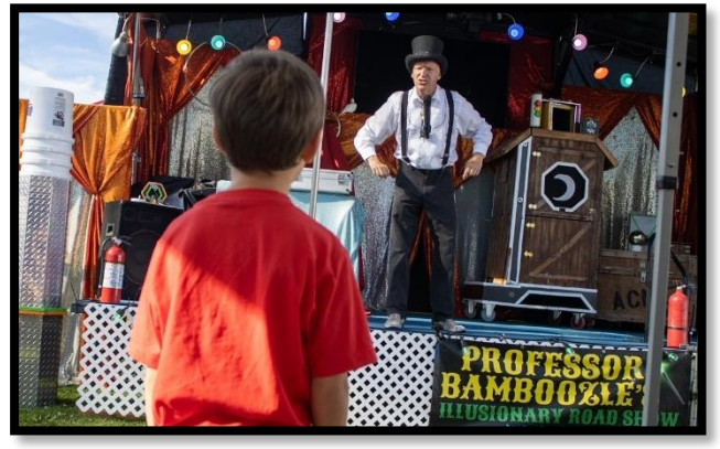
Presenting Free Entertainment Sponsor