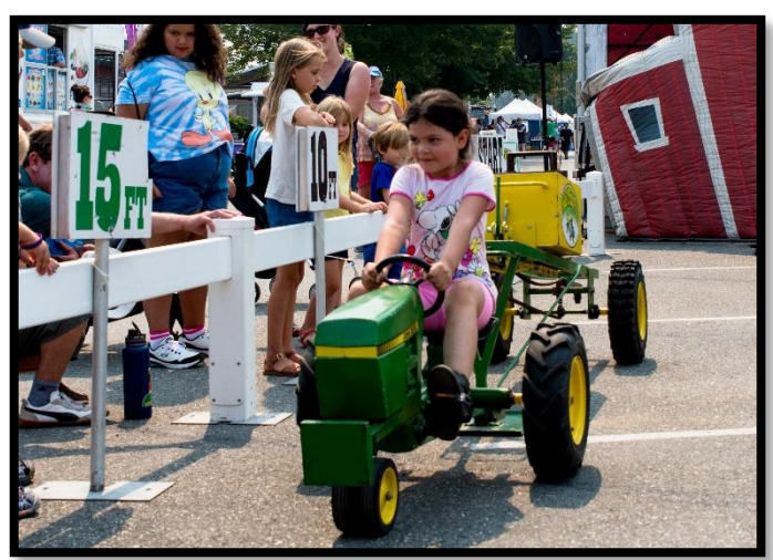
Interactive Family Entertainment

Dedicated Social Media post of presenting day including Logo and link to organization webpage