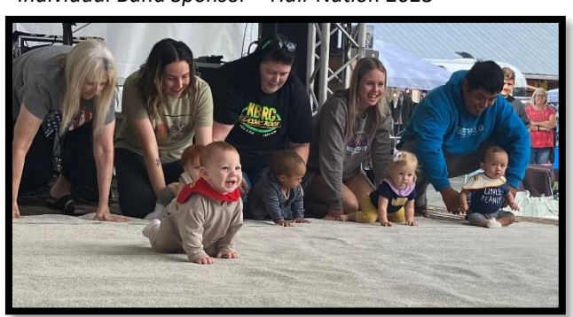
Diaper Derby Sponsor