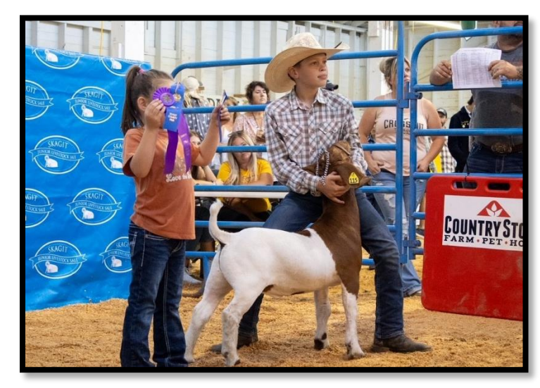
Youth Learning Opportunities at the Fair