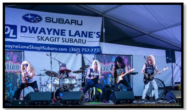
Individual Band Sponsor – Hair Nation 2023