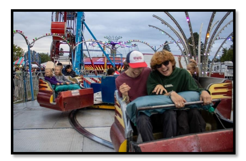
Family Friendly Fun!